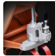
Oil leak-proof pump